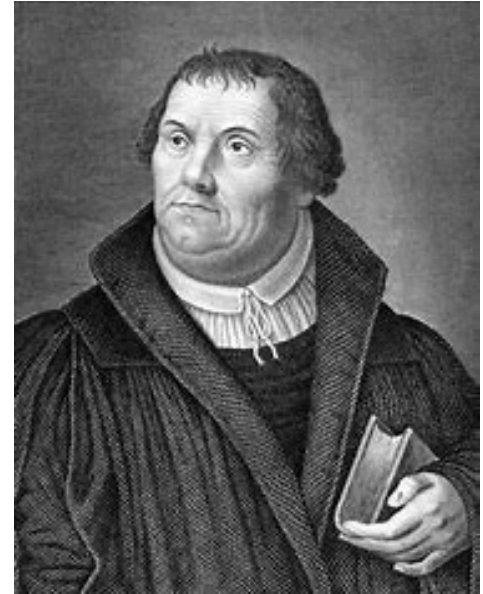
Reformer Martin Luther

The messenger to this Age is the best known messenger of all the Ages. He was Martin Luther. Martin Luther was a brilliant scholar of gentle disposition. He was studying to be a lawyer when the lingering illness and death of a near friend caused him to become serious concerning the spiritual condition of his life. He entered the Augustinian convent at Erfurt in 1505. There he studied philosophy and also the Word of God.