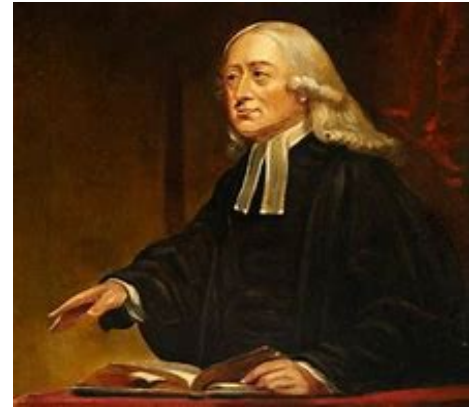
Reformer John Wesley

For this they were called Methodists, and other derisive titles. Now John was sufficiently imbued by his vision of the need of religion for the peoples of the world that he went to America (Georgia) as a missionary amongst the Indians. On his way there he found that many of the ship's passengers were Moravians. He was deeply impressed by their meekness, peace, and courage in all circumstances. His labors in Georgia in spite of self denials and hard work was a failure. He returned to England crying, "I went to America to convert the Indians but oh! who shall convert me?"