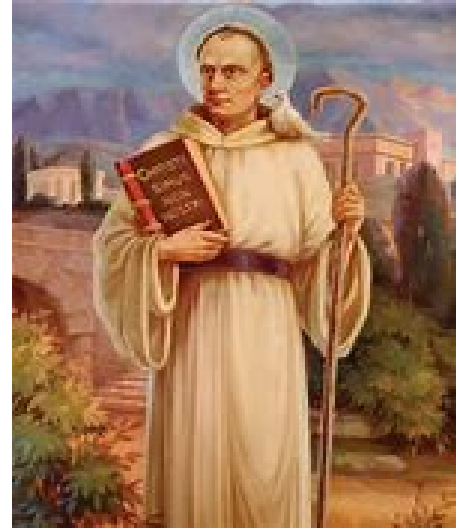
Reformer Saint Columban

After he had heard the voice of God, nothing could stop him, and his miraculous ministry has caused many historians to acclaim him next to the apostles. So great was his ministry with the supernatural signs following that some (especially students in Rome) have thought the accounts were exaggerated.