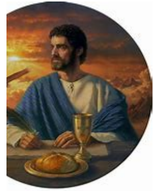
Reformer Saint Martin

Using our God-given rule for choosing the messenger to each Age, that is, we choose the one whose ministry most closely approximates that of the first messenger, Paul, we unhesitatingly declare the Pergamean messenger to be. Martin was born in 315 in Hungary. However, his life work was in France where he labored in and around Tours as a bishop. He died in 399. This great saint was the uncle of another wonderful Christian, St. Patrick of Ireland.