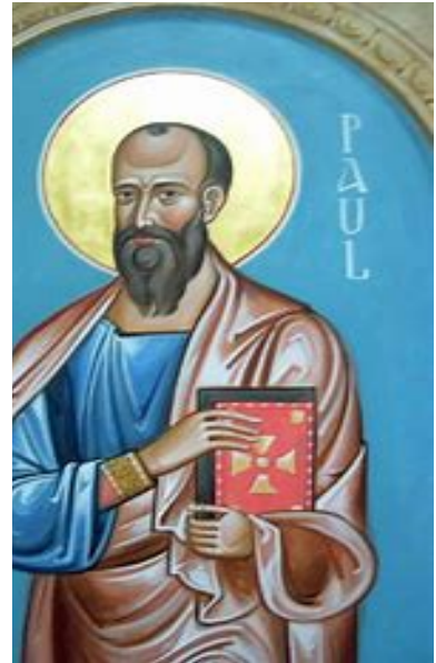
Major prophet Paul

He was the Prophet-Messenger to the Gentiles. His prophetic office, by which he received the full revelation of the Word for the Gentiles, authenticated him as their apostolic messenger. To this agreed the other apostles at Jerusalem.